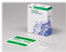
Dental prescale (Fiji Film, Japan)