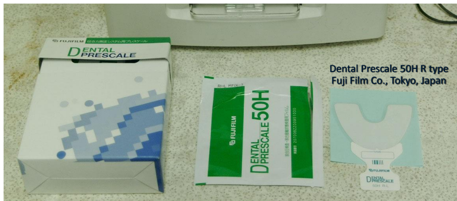
Dental Prescale 50H R type Fuji Film Co., Tokyo, Japan

The occlusal force was calculated after scanning the sheet with an image scanner.