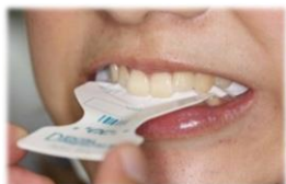
The sheet is bitten by a person.

The microcapsules are collapsed and the color former leaked from it.